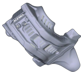
A (1 pcs)